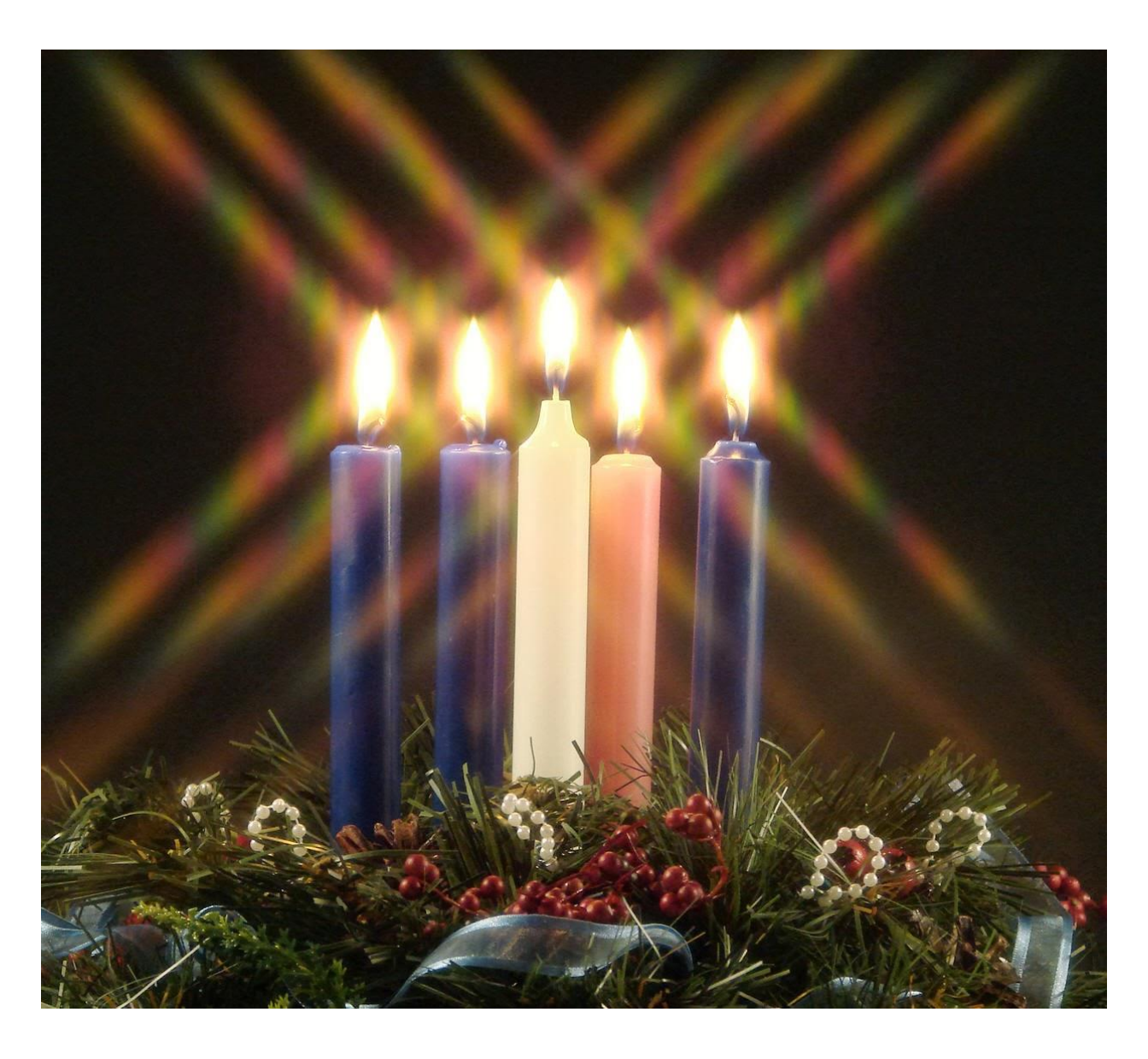
Candlelight Service of Lessons and Carols December 15, 2024