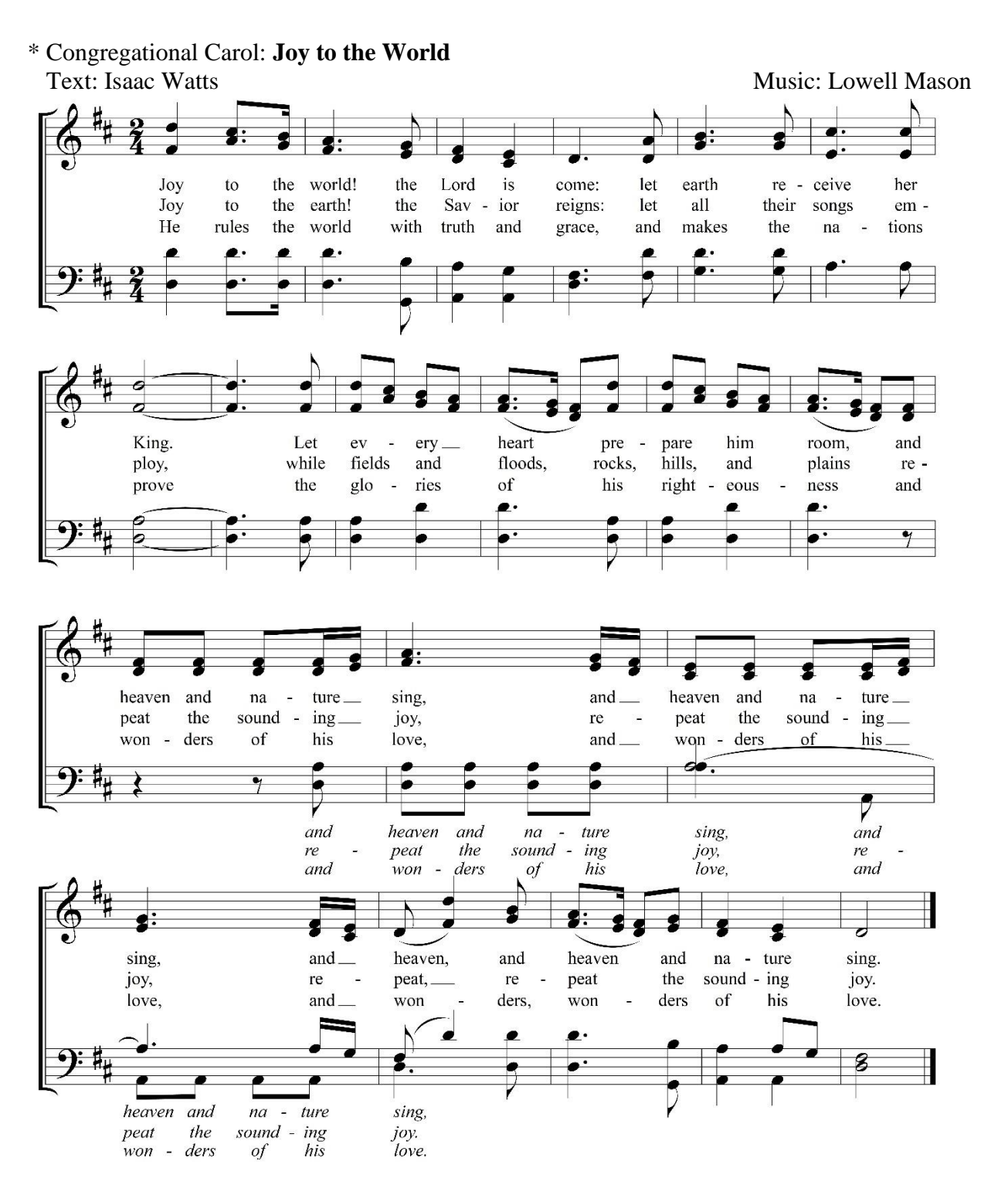
Postlude: Organ Flourish on "Joy to the World"